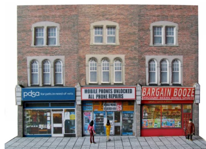
HRM/HRS High Road Shops