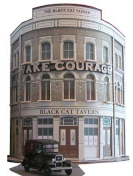
BCT Black Cat Tavern