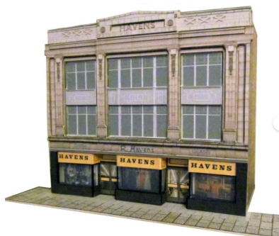
CDS Classic Department Store