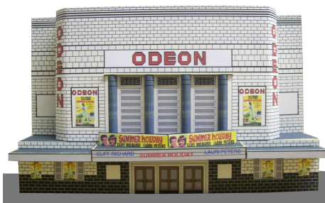
CWLO Chadwell Heath Odeon

See the rest of the range at www.kingswaymodels.com including these:-