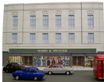
LDS Large Department Store